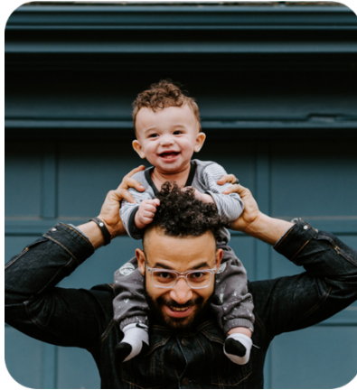
PLAYING WITH BABY