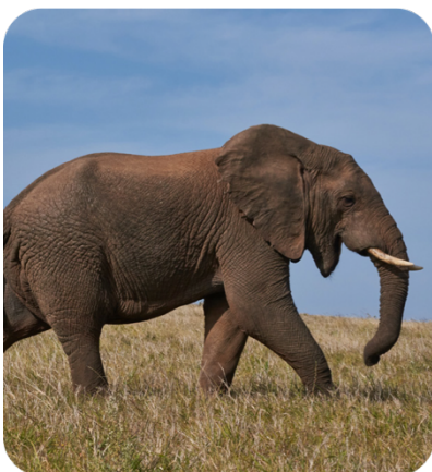
ON A SAFARI